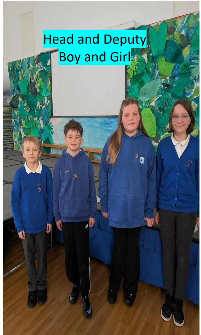
Head and Deputy Boy and Girl