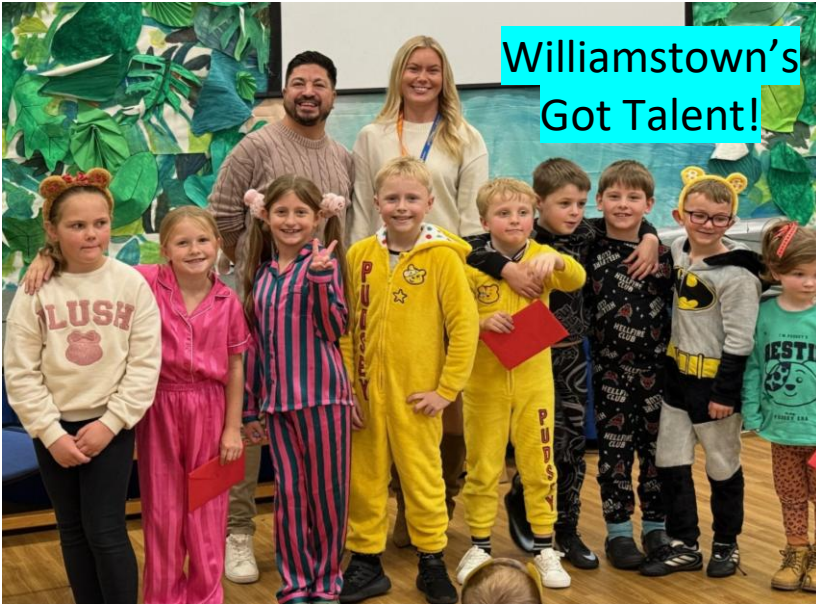
Williamstown's Got Talent!