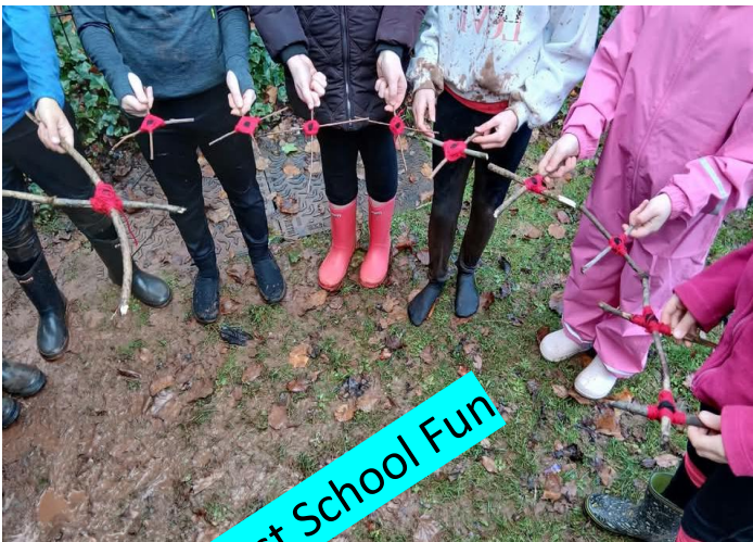
Forest School Fun